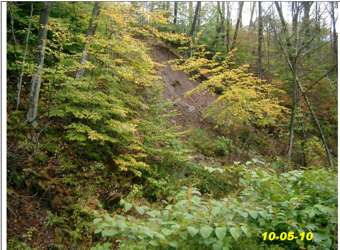
Photo 3: Looking upstream at right streambank erosion from Beers Brook Road.