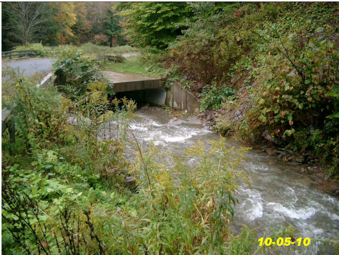
Photo 5: Looking downstream at culvert at lower end of project area.