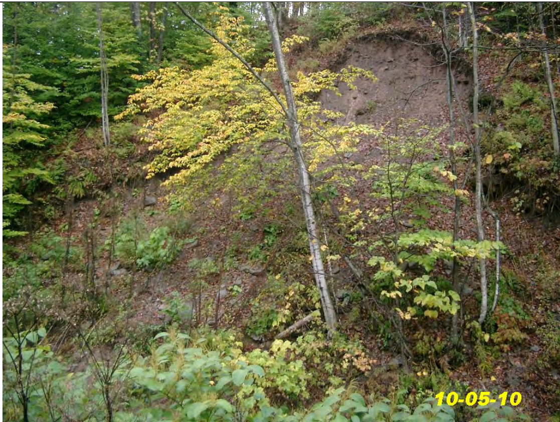
Photo 1: Looking at right streambank erosion from Beers Brook Road.