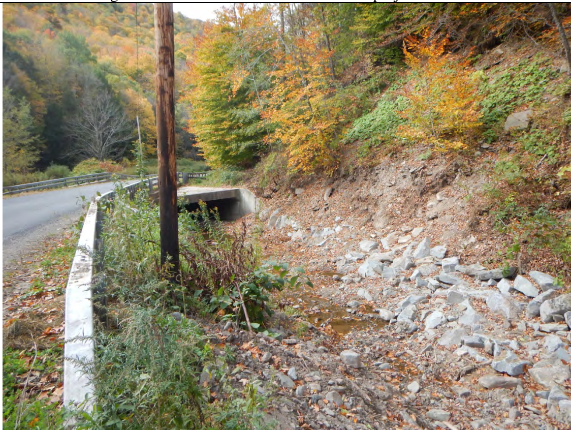
Photo 6: Looking downstream after construction at culvert at lower end of project area with rock rip rap at the toe of the bank.