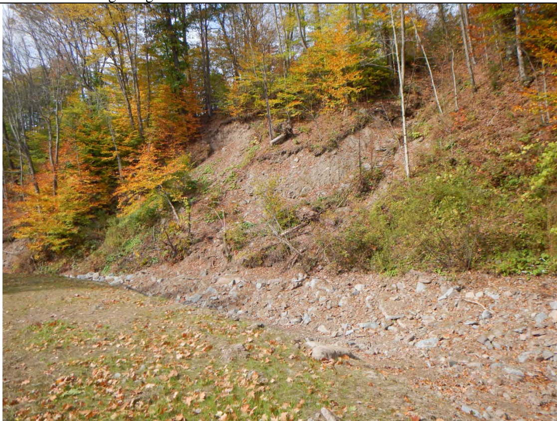
Photo 2: Looking downstream after construction of rock rip rap along the toe of right streambank.