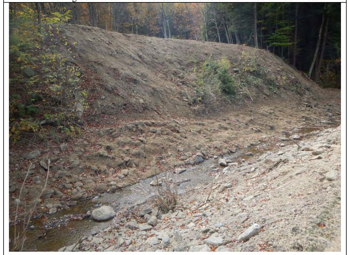
Photo 2: Looking downstream after construction at rock rip rap along the left toe of streambank.