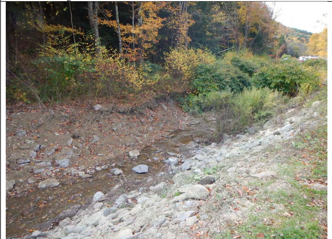
Photo 4: Looking downstream after construction at hardened riffle and rip rap along the toe of left streambank