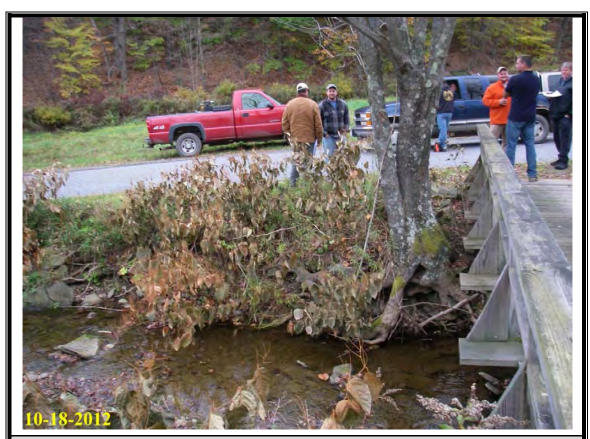
Photo 3: Before construction, looking at right streambank standing on private bridge.