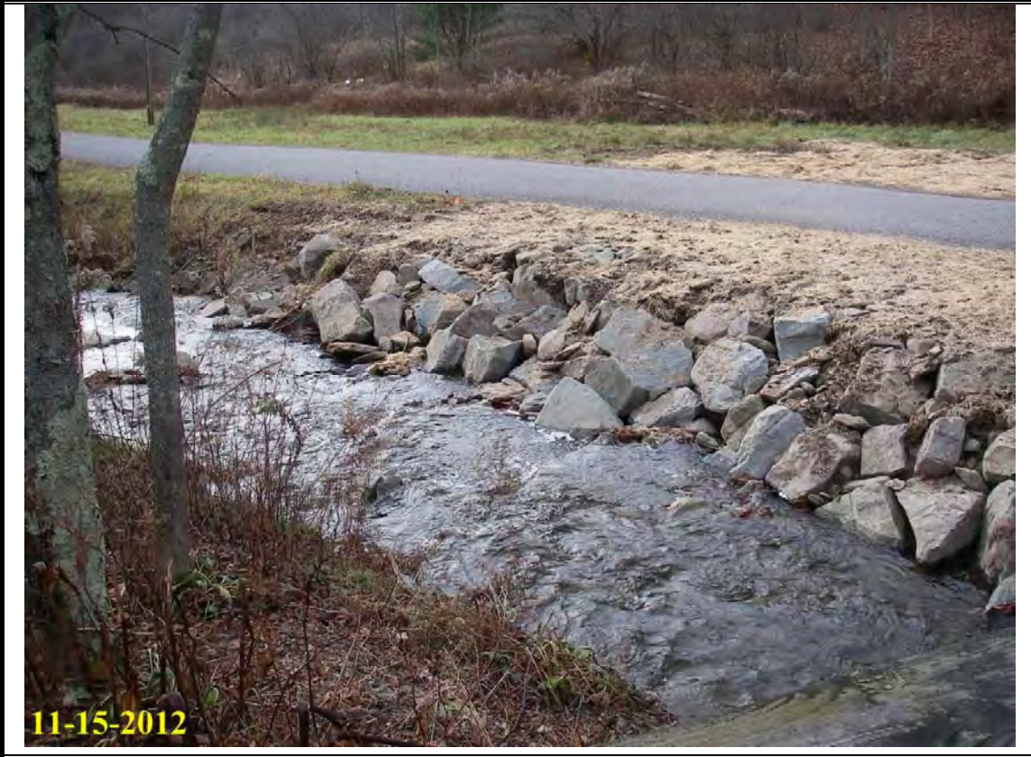
Photo 2: After construction, looking downstream from left streambank standing on private bridge.