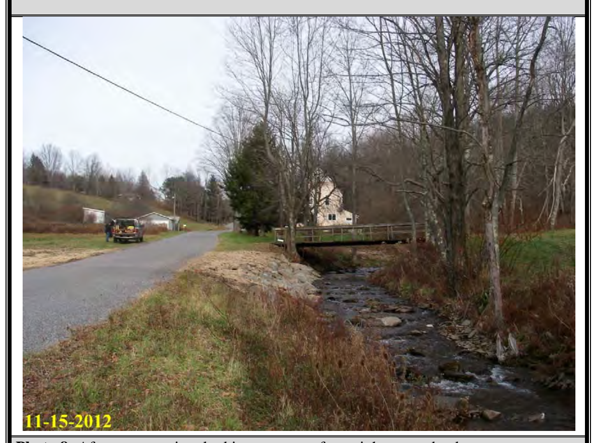
Photo 8: After construction, looking upstream from right streambank.