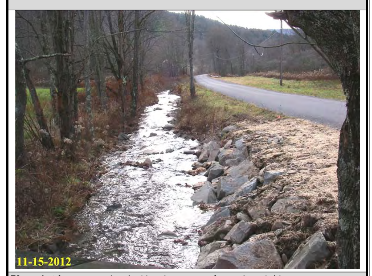
Photo 6: After construction, looking downstream from private bridge.