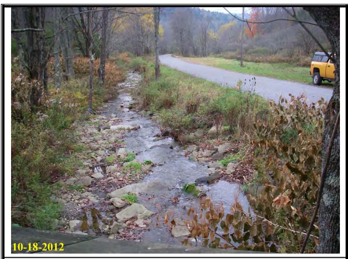
Photo 5: Before construction, looking downstream from private bridge.