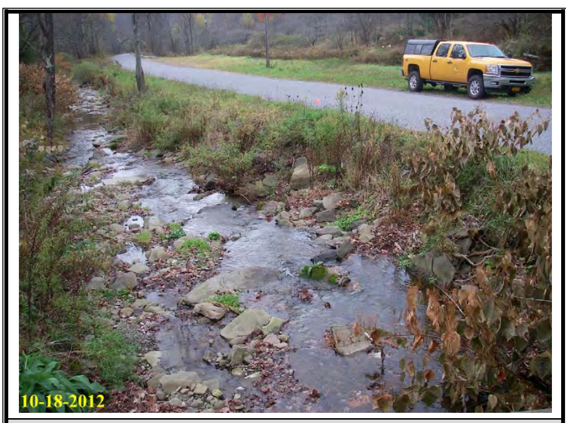
Photo 1: Before construction, looking downstream from left streambank standing on private bridge.