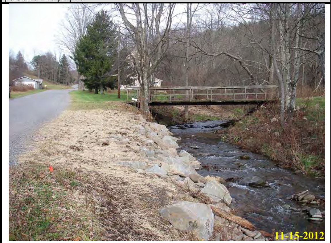
Photo 10: After construction, looking upstream from right streambank at lower portion of the project.