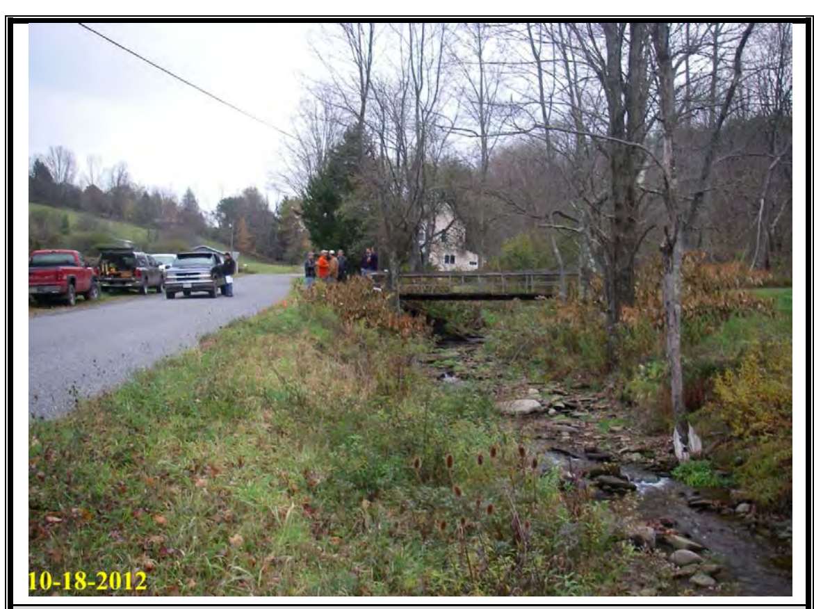
Photo 7: Before construction, looking upstream from right streambank.