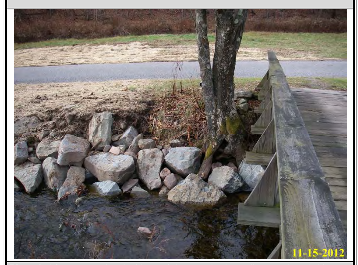
Photo 4: After construction, looking at right streambank standing on private bridge.