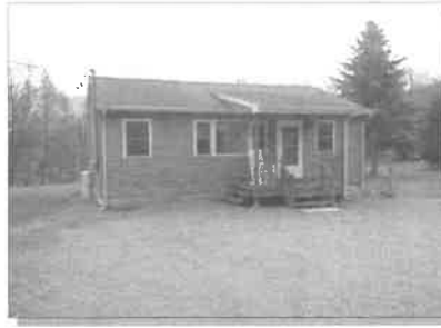
125689 297.-1-18.3 165 Wood Ln