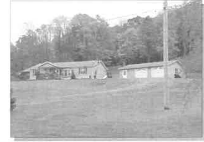
125689 295.-1-3.11 2272 South River Rd