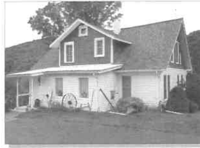
125689 231.-1-18.1 654 Nichols Rd