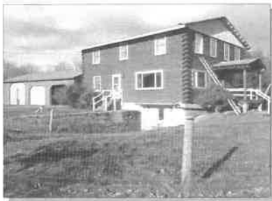
125689 187.-2-2.2 2923 Loomis Brook Rd