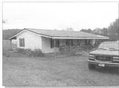
125689 187.-2-20.4 290 Beebe Rd