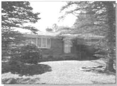
125689 252.-1-18 1997 Marvin Hollow Rd