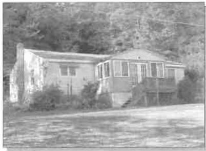
125689 252.-1-46.2 167 Upper East Brook Rd