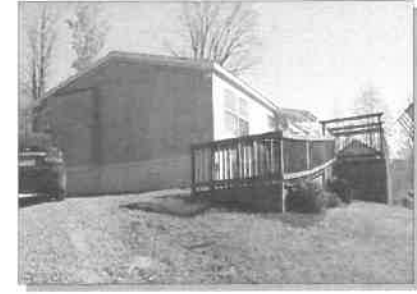
125689 272.-2-43.42 2271 Walton Mtn Rd