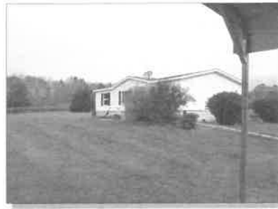
125689 187.-2-20.3 320 Beebe Rd