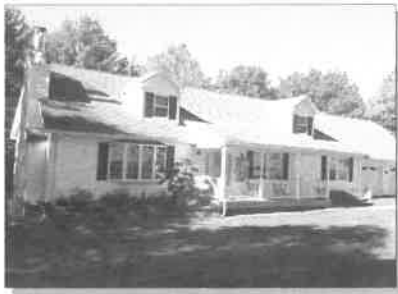
125689 207.-2-22.3 4955 Pines Brook Rd