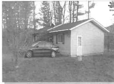
125689 275.-2-3.2 30816 State Hwy 10