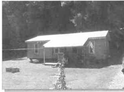
125689 335.-2-6 165 Wakeman Brook Rd