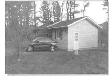
125689 275.-2-3.2 30816 State Hwy 10