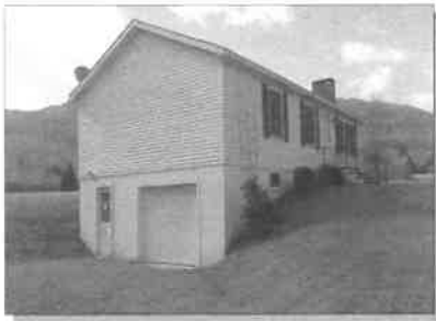
125689 296.-1-40.5 1724 East River Rd