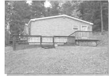
125689 294.-3-3.2 2060 South River Rd