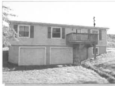
125689 229.-1-12.4 15027 State Hwy 206