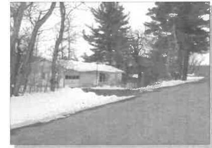
125689 186.-3-14.111 2059 Loomis Brook Rd