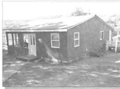
125689 230.-1-42 463 Seely Wood Rd