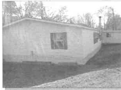
125689 211.-3-6 405 Feak Hollow Rd