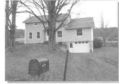
125689 272.-2-1.2 1679 Bobs Brook Rd