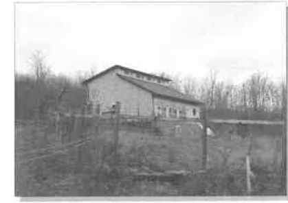
125689 272.-2-29.2 2085 Bobs Brook Rd