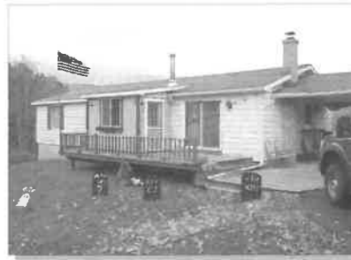
125689 207.-2-16.111 1127 Loomis Brook Rd