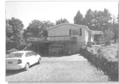
125689 251.-1-33.3 16262 State Hwy 206