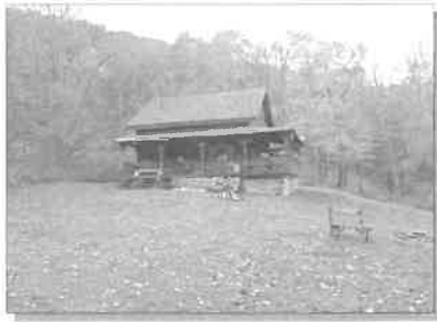
125689 297.-3-14.2 680 Weed Brook Rd