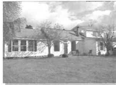
125689 232.-2-24.1 1271 MacGibbon Hollow Rd