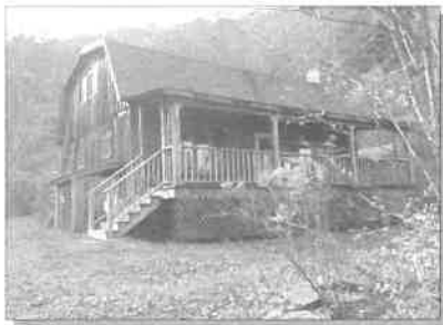
125689 297.-2-8.3 15 John Lockwood Rd