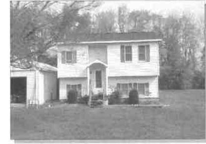
125689 272.-2-36.4 61 Horse Country Ln