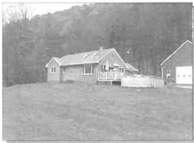
125689 274.-2-34 30027 State Hwy 10