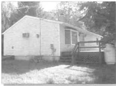
125689 208.-1-32 13064 State Hwy 206