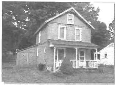
125601 251.20-1-5 35 Bruce St