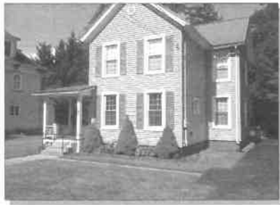
125601 273.8-1-21 41 Griswold St