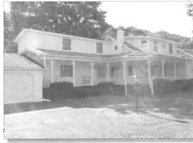
125601 273.8-2-30 72 Griswold St