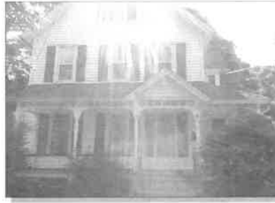
125601 273.8-3-39 42 Park St