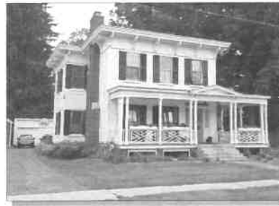
125601 251.19-9-11 14 Mead St