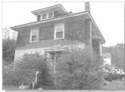
125601 273.12-6-4 62 Stockton Ave