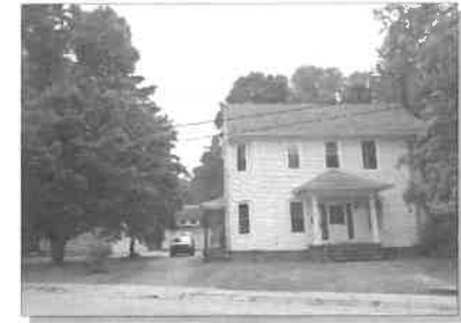
125601 273.11-3-4 81 Stockton Ave