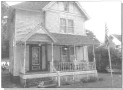
125601 273.8-3-35 32 Park St