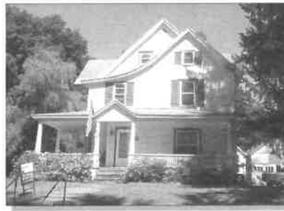
125601 251.20-2-12 15 East Brook St