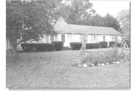
125601 251.20-1-2 16 Pine St