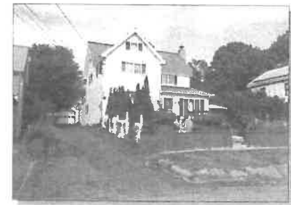
125601 251.19-2-10 28 Burton St