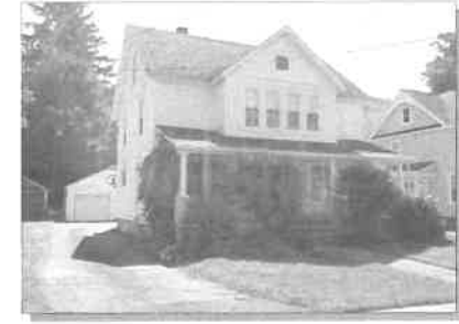
125601 251.20-8-11 88 Griswold St