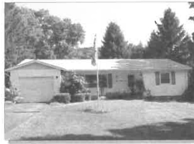
125601 251.20-3-8 34 Mount Pleasant Rd