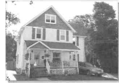
125601 251.19-6-13 102 Townsend St