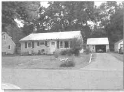
125601 273.11-3-16 17 Maple St