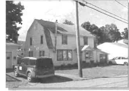
125601 273.11-7-36 4 Maple St