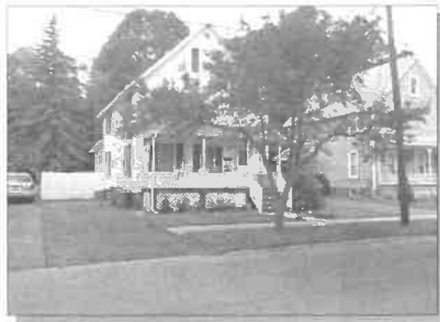
125601 251.19-12-5 87 Liberty St