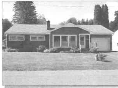
125601 273.11-7-51 36 Maple St