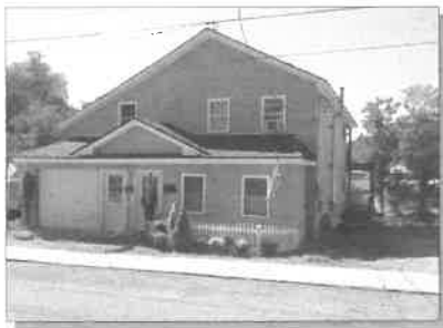
125601 251.19-1-2 53 Burton St