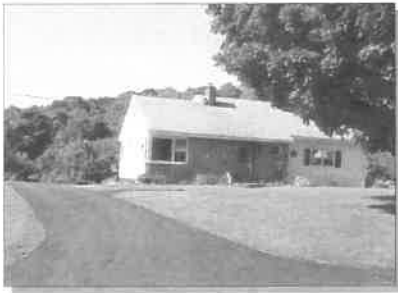
125601 251.16-5-2.1 33 Mount Pleasant