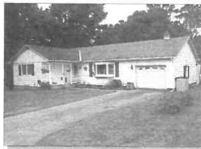
125601 251.16-6-7 53 Bruce St