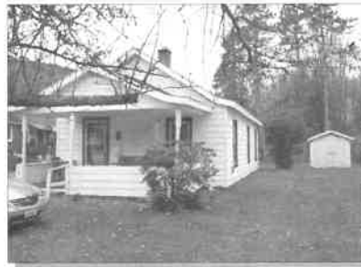
125601 273.11-3-9 63 Stockton Ave