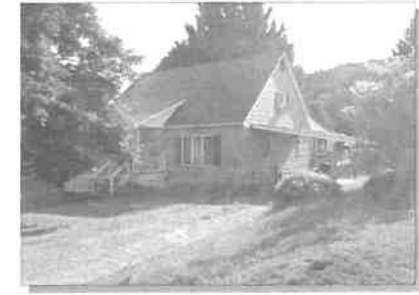
125601 273.6-1-5 7 Munn St